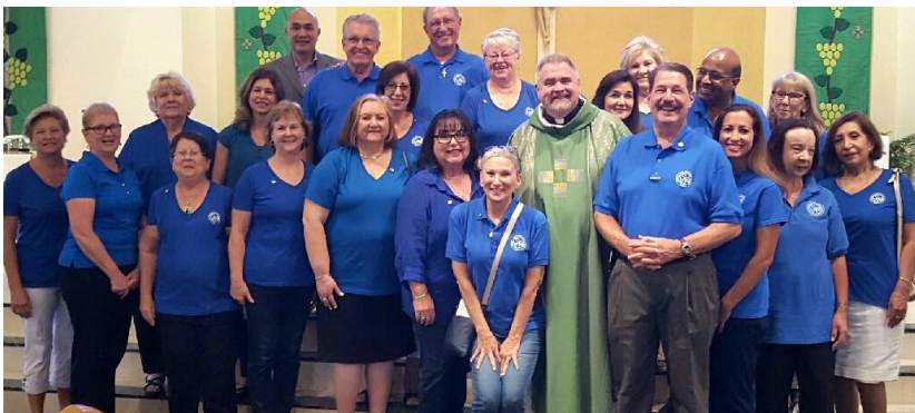
Vincentians who serve you.

"Our Food Team hand picks meats and products every Monday for you from Second Harvest and fresh bread and pastries are delivered from local stores. We strive to provide nutritional foods to you and your family from the basic food groups. If you receive something you can't eat, please share it with your neighbor."